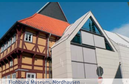
Flohburg Museum, Nordhausen

Constant feuding with the Earls of Hohnstein, Stolberg, and Schwarzburg necessitated, from the Middle Ages through to the Modern era, continual upgrading of the walls and defensive towers that made up Nordhausen's fortifications. Access to the town centre of Nordhausen – a Free Imperial City until the end of Imperial immediacy in 1802 – could be gained via the four main gates: Toepfer Gate, Rauten Gate, Neuweg Gate and Barfuesser Gate. The stones to build the fortifications were supplied by the surrounding villages. Dolomite quarried on Kohnstein Hill made up the majority of the stone used. An air raid shortly before the end of the Second World War, on April 4 th , 1945, destroyed more than 70% of the city. This is part of the reason why only 1,600 m of the city wall is still standing for visitors to see. Geology and city history are vividly presented in the Flohburg Museum on Barfuesserstrasse.