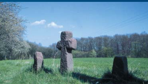
Bell Stones, Steigerthal

We take another side-trip now, to the western edge of the Alten Stolberg Hills, a small range of Harz foothills. Here, on the old military road to Magdeburg, lies the village of Steigerthal. It was first recorded in a document issued in Walkenried in 1288 as 'Villa stegerdal'. From 1414 the village was part of the territory of the Stolberg Earls. Prior to that, from 1345, it was under the control of the Ilfeld Monastery. About 1 km southwest of Steigerthal, on Haard Hill, stands a group of stones. According to the legend, the cross of porphyry and the stones on either side of it, serve as reminders that a bell founder from Stolberg murdered his journeyman here, because the journeyman had cast a bell better than the bell founder himself. The exact age of the stones is unknown. An atonement cross is placed as a memorial and to prompt passers-by to pray for the soul of those killed.