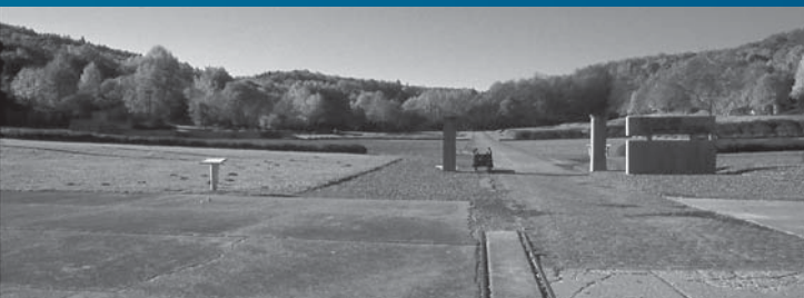
Former parade ground

A major expansion was made to the man-made cavern system in Kohnstein Hill when, in 1935, the Economic Research Company Ltd. (WiFo), a branch of the Reich Ministry of Economics, began to excavate an extensive system of tunnels. Today it is known that this work was, without question, part of the preparations for war. The planned fuel dump for the army had almost been completed by the late summer of 1943 when air strikes on Peenemuende made the relocation of rocket production facilities necessary. Therefore, at the end of August 1943, a satellite camp of the Buchenwald Concentration Camp was hurriedly constructed at Kohnstein Hill with the name 'Dora'. The SS sent people from the occupied territories to the camp near Nordhausen to work on its construction. The prisoners were confined to the tunnel system day and night and a great many fell victim to the murderous working