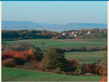
On the Karst Hiking Trail