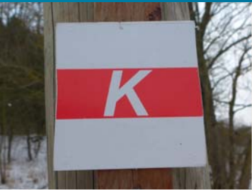
Karst Hiking Trail signpost

Two trails in the Harz region have been recognised as high-quality trails by the “Walkable Germany” programme of the German Hiking Association. They are the Harz Witches Trail (Harzer Hexen-Stieg) and the Karst Hiking Trail (Karstwanderweg). The latter traverses the ca. 100 km swathe of karst landscape on the southern edge of the Harz Mountains. The 235 km long trail connects Foerste, a village belonging to the township of Osterode am Harz in Lower Saxony (Landmark 5 ), with Poelsfeld, belonging to the township of Allstedt in Saxony-Anhalt (Landmark 12 ). Between Foerste and Kleinen Steinberg Hill (located between Gudersleben and Maunderode), as the trail runs through Thuringia, it follows two separate, parallel routes. Along the trail there are ca. 200 information boards informing hikers about karst phenomena including caves, sink-holes and dolines, springs, streamsinks and infiltration points, karst cones, subterranean cavities and galls.