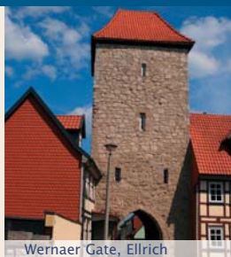
Wernaer Gate, Ellrich