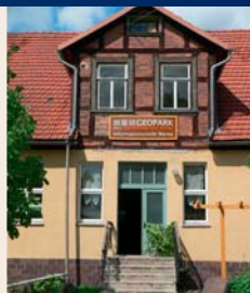
Information Centre, Werna