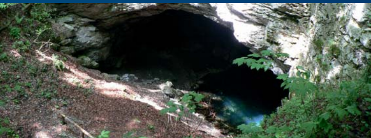
Kelle Cave with grotto lake

Up until the Reformation Kelle Cave was a destination for pilgrims.