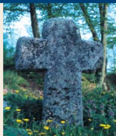
Stone cross, Suelzhayn