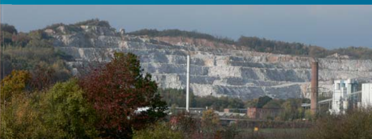
Excavation face, Kohnstein Hill

On our tour of discovery through the Geopark we come from Ilfeld (in the area covered by Landmark 6 ), either by car on the B4 or with the Harz Narrow Gauge Railway, to Niedersachswerfen. Both villages have belonged to the administrative district of Harztor since the beginning of 2012. On our way to Niedersachswerfen we followed the Bere, a 17 km long creek which rises near Thuringia's border with Saxony-Anhalt at 600 m above sea level. The Bere joins the Zorge in Thuringia at the foot of the 334.9 m high Kohnstein Hill. The source of the Zorge, on the other hand, is in Lower Saxony. It flows through Ellrich, Niedersachswerfen, and Nordhausen, and then into the River Helme northeast of Heringen. The area of the Geopark detailed in this pamphlet stretches along both sides of the Zorge. The pamphlet has been titled "Kohnstein Hill" because the hill is a landmark visible from far and wide in this area.