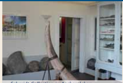
Schmidt Collection in Aschersleben

collection exponents. In a letter of thanks from the magistrate of the city of Aschersleben, dated the 28<sup>th</sup> August 1928, stands the following citation: "... so the cabinet set up by your own hand is something for gourmets ...". In fact, the delicacy referred to were very valuable fossils. SCHMIDT's book, published in 1929, "Die Lebewelt unserer Trias" (Flora and Fauna of Our Triassic), remains a standard work and was reissued in 2000 (approximately 2,300 illustrations, the most extensive reference work on the German Triassic period). In the museum, many of the original illustrations are to be found in the historic collection drawers. Prehistoric and early history, city history and the Free Masons' Temple of the Johannis Lodge are further themes in the museum along with changing special exhibitions.